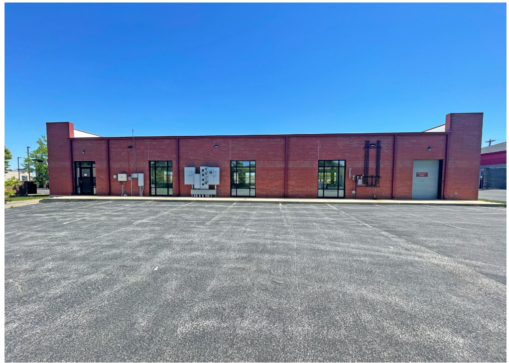
Additional Parking Behind Building